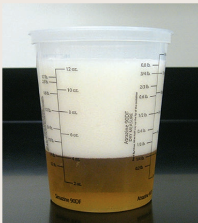
Water + Pesticide

Dimethylpolysiloxane, Methylated Silicon, Inert Ingredients