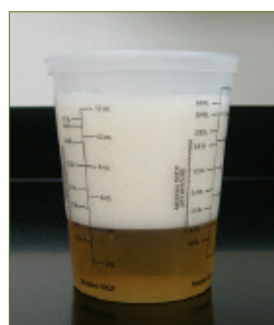
Foam in cup – no Foaminator Dry

FOAMINATOR will not interact with any of the chemicals to which it is applied.